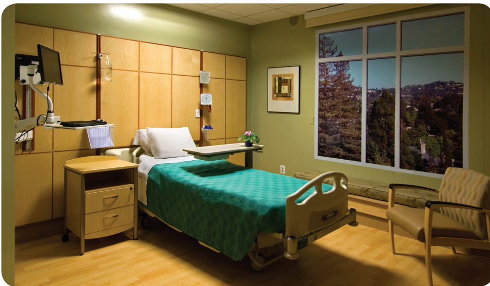
Future Patient Room

Sequoia Hospital 170 Alameda de las Pulgas Redwood City, CA 94062 (650) 369-5811 www.SequoiaHospital.org